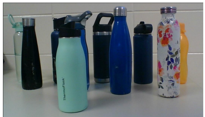
Lonesome water bottles in the lost and found

After a recent trip to the lost and found, I have realized that when people lose something, they might think the worst and not look for it. The lost and found is overflowing with bike helmets, shelves and piles of coats, and beautiful and expensive water bottles. There are thousands of dollars worth of lost things that people are constantly replacing. This is very wasteful if you lose things a lot, because it takes energy to make new things, so next time you pass the gym, check to see if you recognize anything, whether it is yours or a friend's.